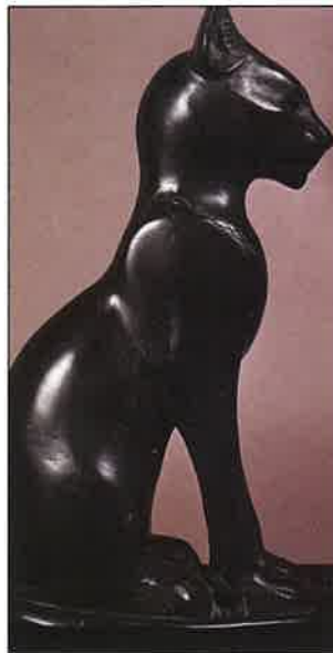
CAT ASSOCIATED WITH BAST, GODDESS OF THE HOME