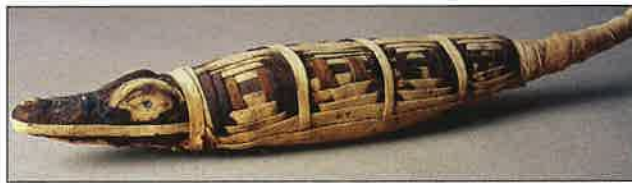
CROCODILE ASSOCIATED WITH SOBEK, A GOD OF THE WATER