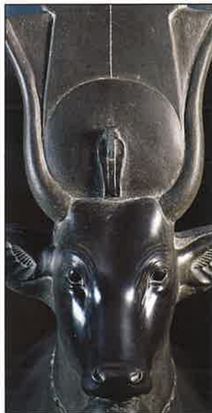
COW ASSOCIATED WITH HATHOR, GODDESS OF LOVE AND MOTHERHOOD

◀ CATS WERE sacred to the Egyptians. In the city of Bubastis, the largest center of cat worship, cats were embalmed, wrapped, and placed in cat-shaped coffins before being buried in a cat cemetery. In the 1800s, around 300,000 cat mummies were discovered in Bubastis. They were shipped to England to be made into fertilizer and then sold!